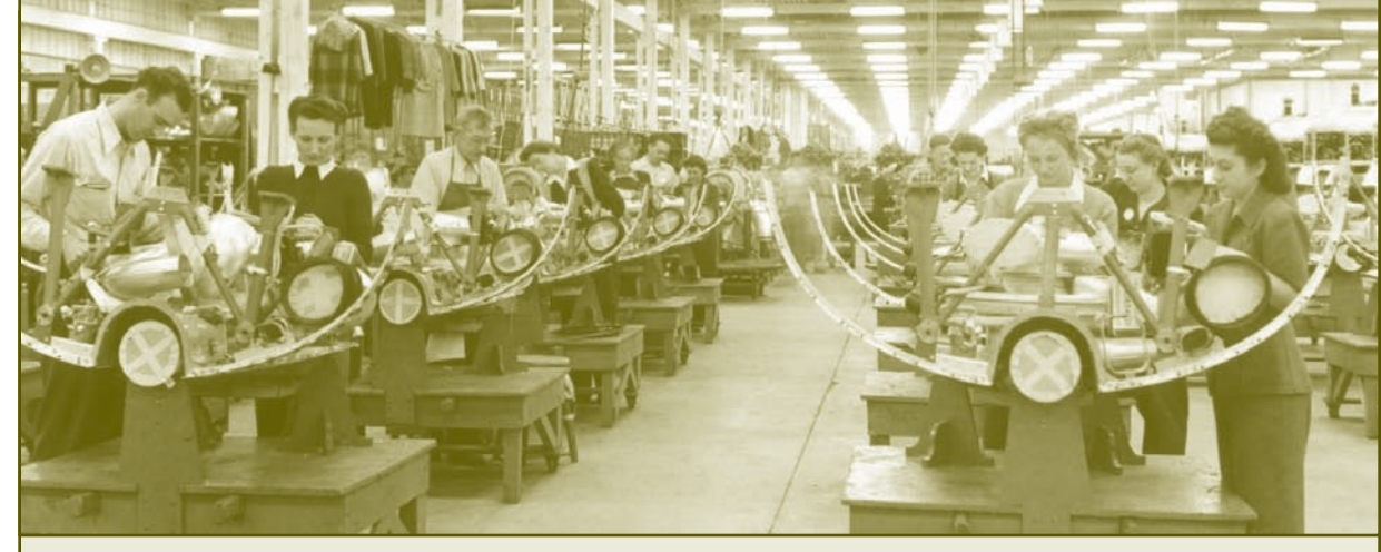
Super Charger Assembly Line Round-the-clock assembly lines at Rohr during World War II, kept power packages for the Consolidated B-24 moving toward completion.